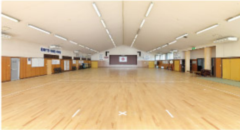
The largest martial arts hall dedicated to kendo