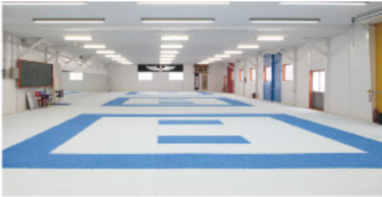
Karate training GYM