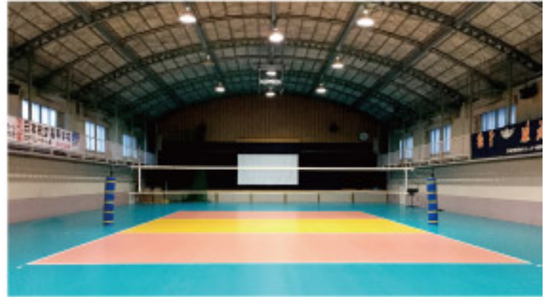
Taraflex volleyball court